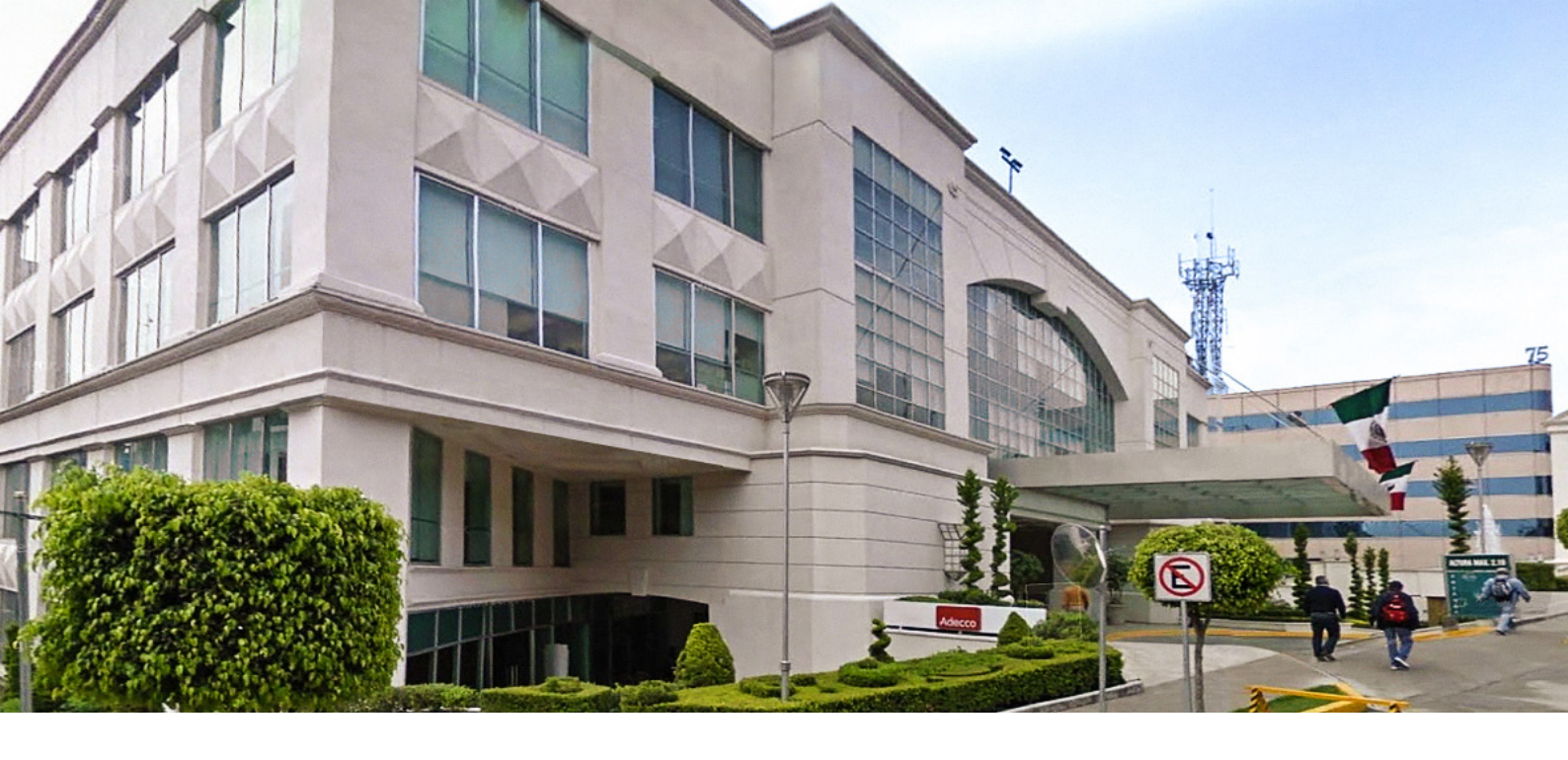
Project: PepsiCo Latin America office building, Mexico