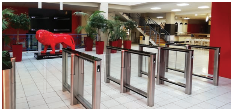
EMLYON Business school, France