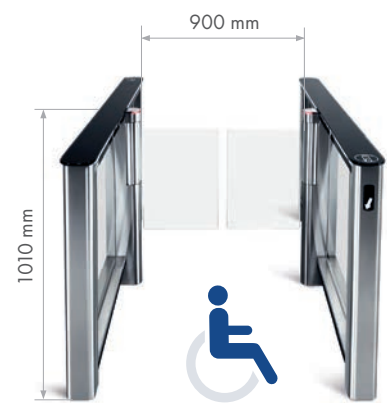
ST-01 Speed gate with swing panels ATG-425