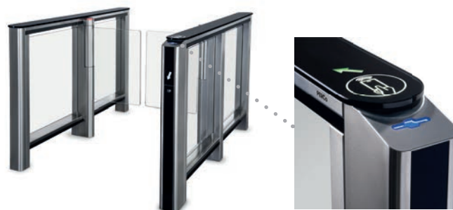
ST-01 Speed gate with built-in card capture reader