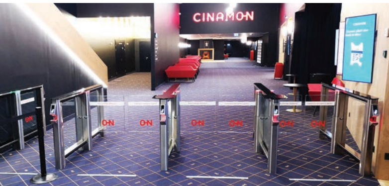
Cinamon cinema chain, Latvia