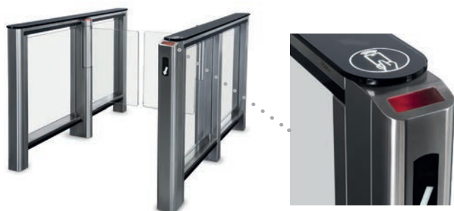
ST-01 Speed gate with panel for built-in barcode reader