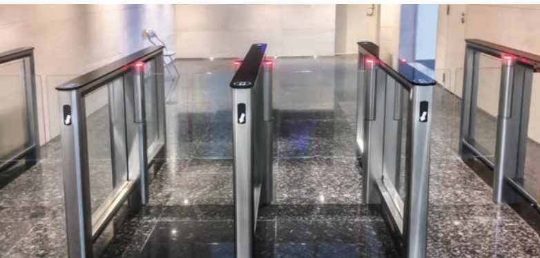
Vietnam National Defense TV studio, Vietnam