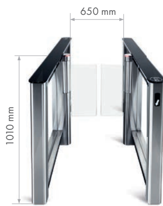
ST-01 Speed gate with swing panels ATG-300