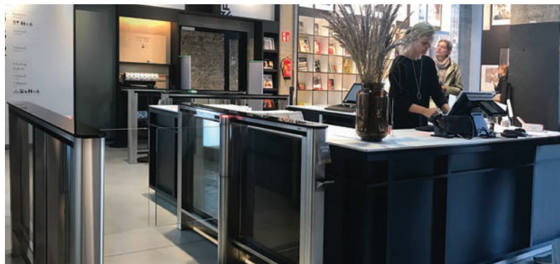
Fotografiska photographic art center, Estonia