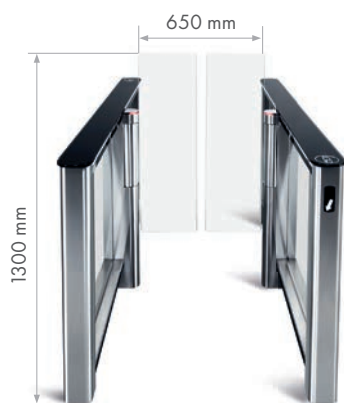
ST-01 Speed gate with swing panels ATG-300H