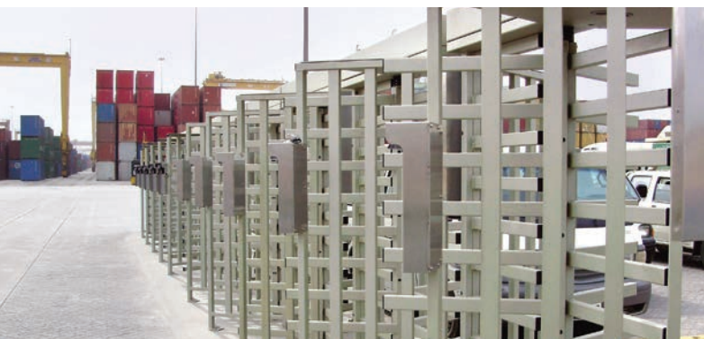
Jebel Ali Port, UAE